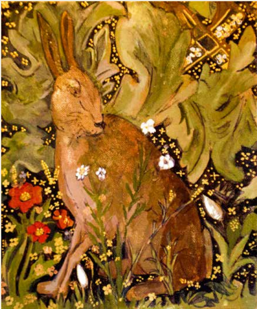
5 Oil paint and gold on canvas 30 x 25 cm