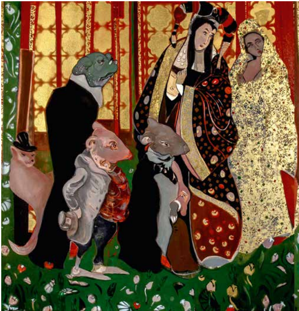
2 Oil paint and gold on canvas 100 x 100 cm