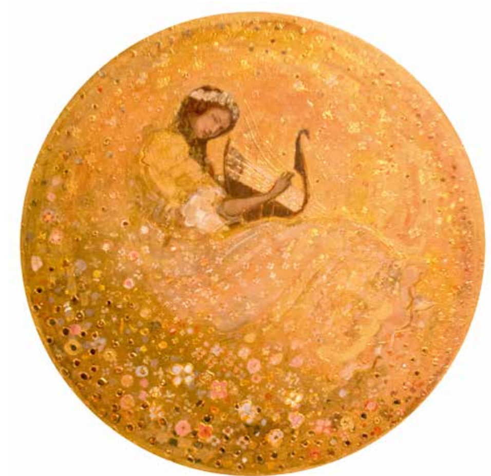
10 Oil paint and gold on canvas D. 40 cm