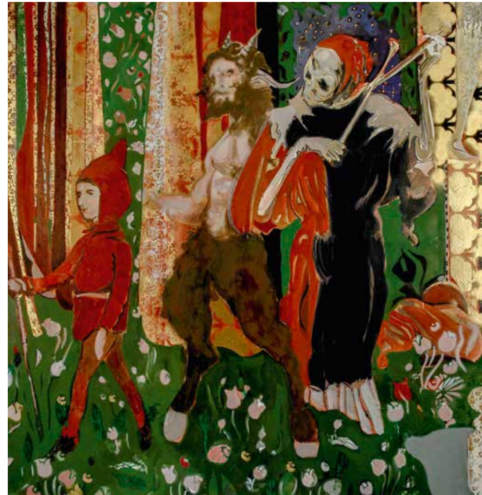
3 Oil paint and gold on canvas 100 x 100 cm