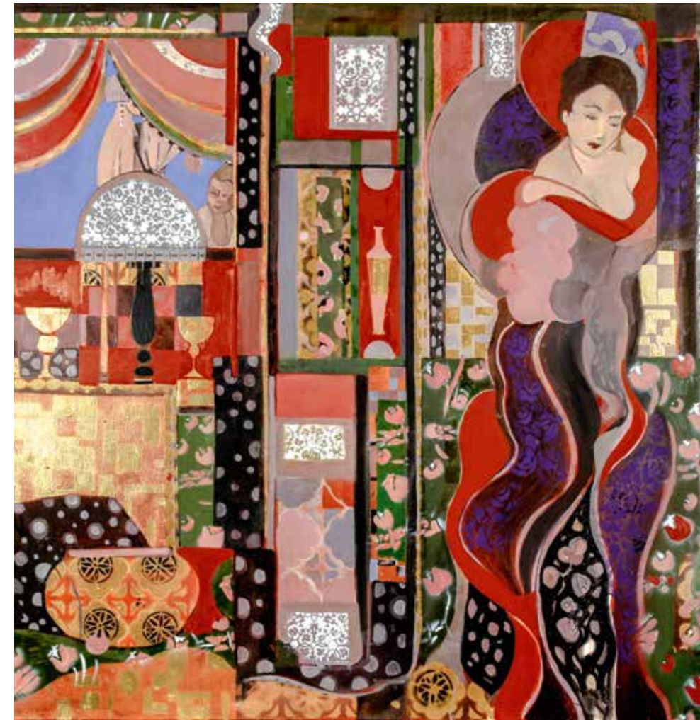
13 Oil paint and gold on canvas 100 x 100 cm