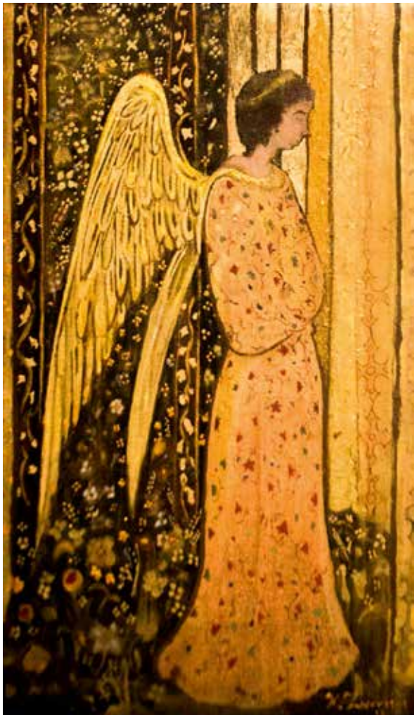
8 Oil paint and gold on canvas 41 x 26 cm