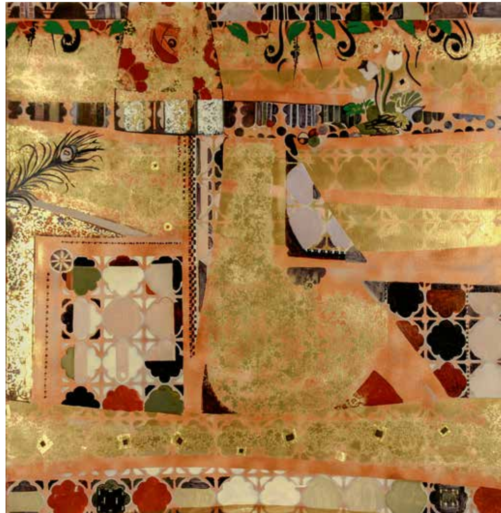
17 Oil paint and gold on canvas 100 x 100 cm