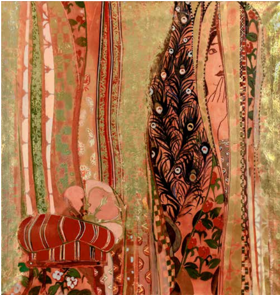
16 Oil paint and gold on canvas 100 x 100 cm