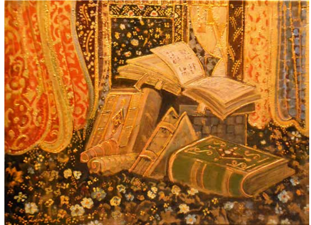
11 Oil paint and gold on canvas 30 x 40 cm