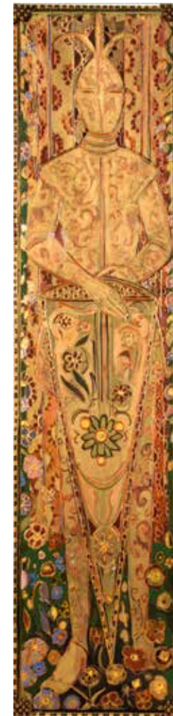
7 Oil paint and gold on canvas 144 x 34 cm