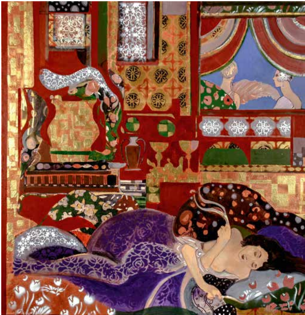
12 Oil paint and gold on canvas 100 x 100 cm