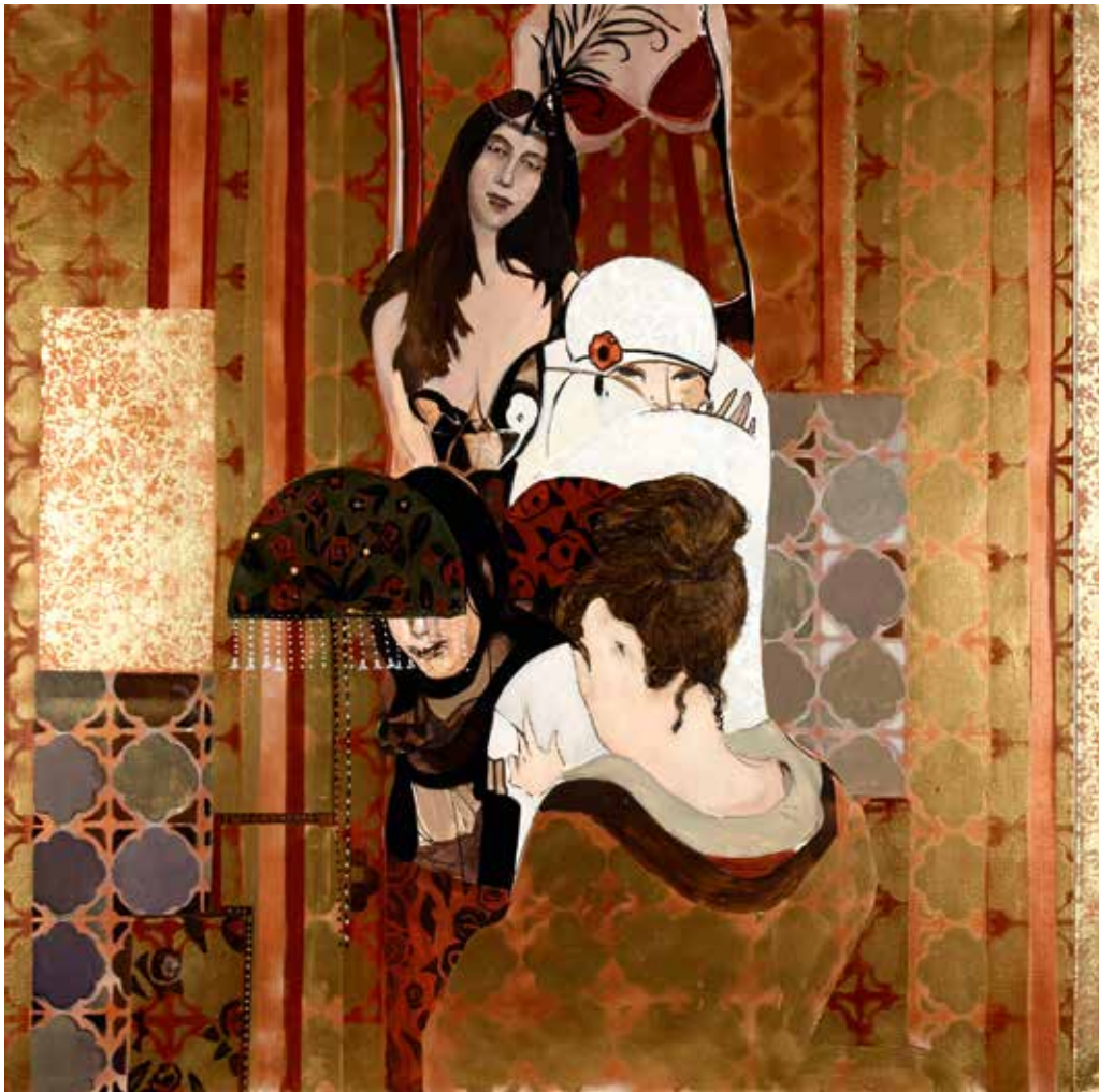
14 Oil paint and gold on canvas 100 x 100 cm