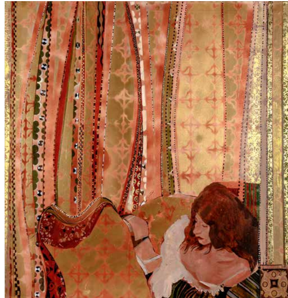
15 Oil paint and gold on canvas 100 x 100 cm