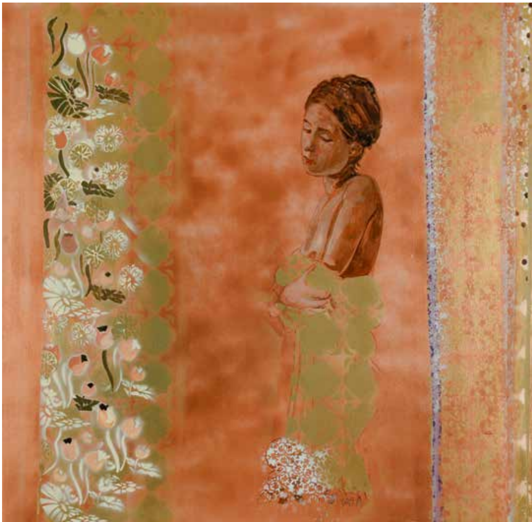
18 Oil paint and gold on canvas 100 x 100 cm