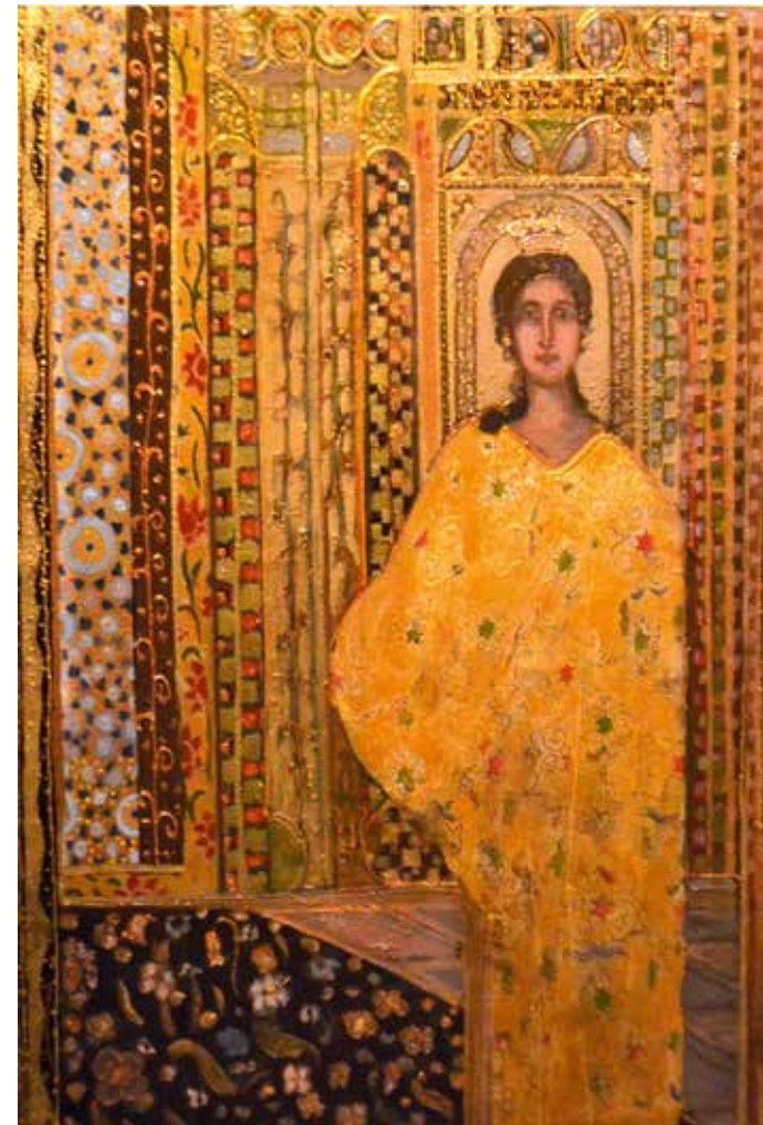
9 Oil paint and gold on canvas 54 x 36 cm