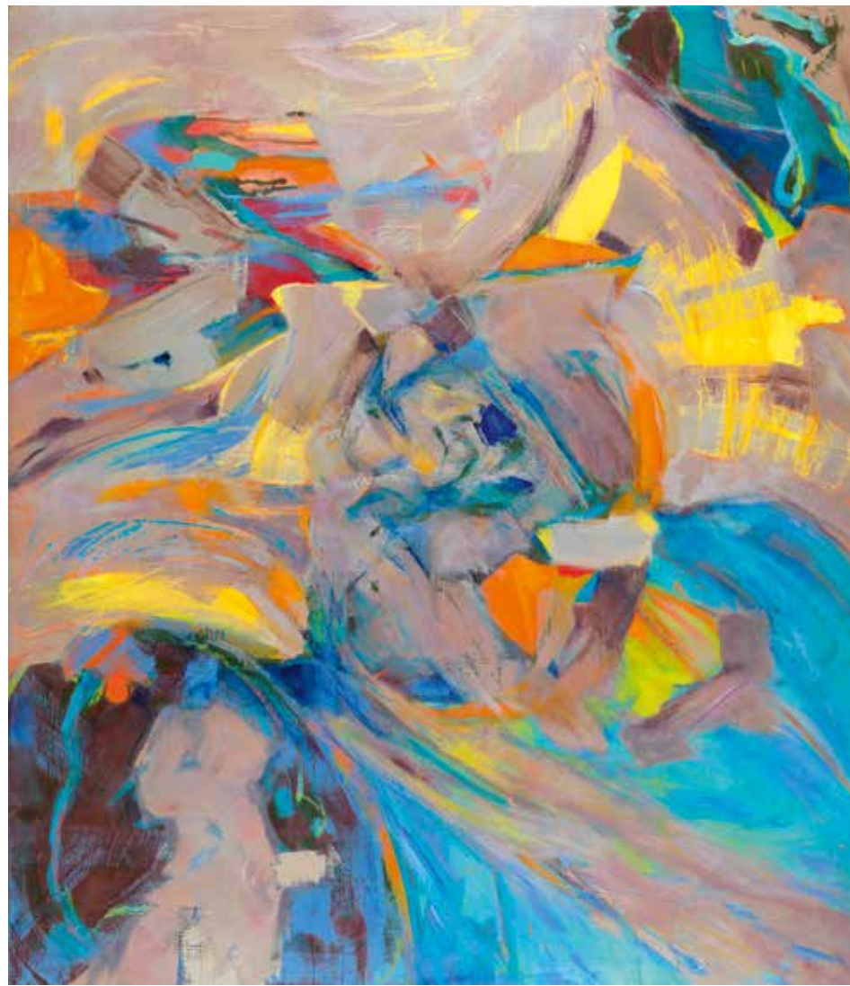
Ancient topography oil on canvas, 150 x 130 cm